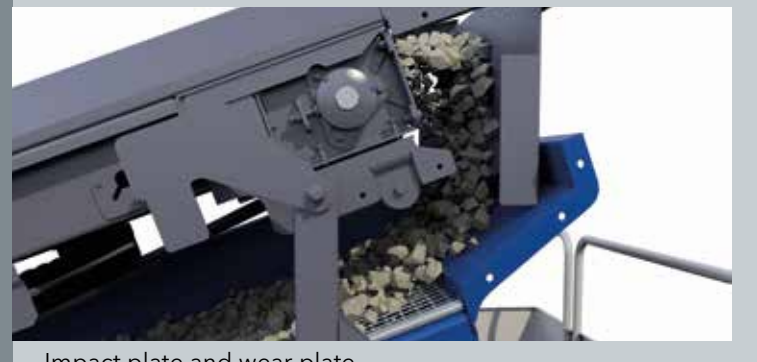
Impact plate and wear plate