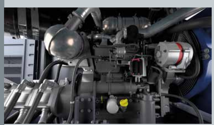
Efficient drive unit