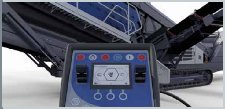
Mobile control panel

Intuitive and easy-to-use control system via mobile control panel