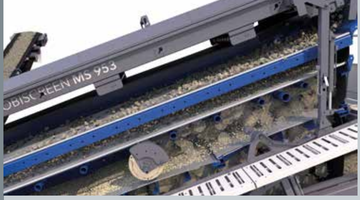
Plant with 2 or 3 decks

The screening surface is easy to change thanks to good accessibility from all sides and wedge clamping device