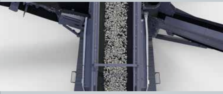
Extra-wide feeding conveyor

Efficient screening surface usage thanks to extra-wide feeding conveyor as a smooth or cleated belt