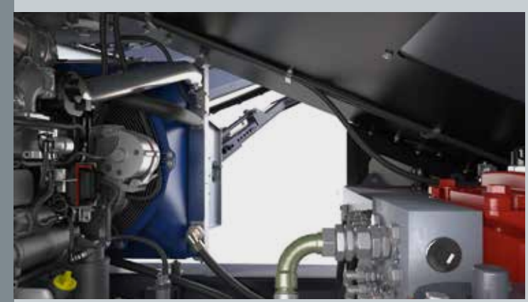
Access to drive unit and service components