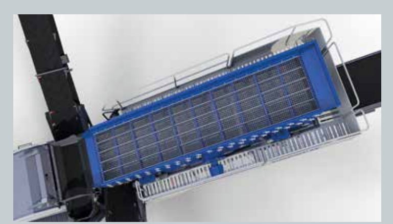
Screening surface of 7 or 9.5 m^2